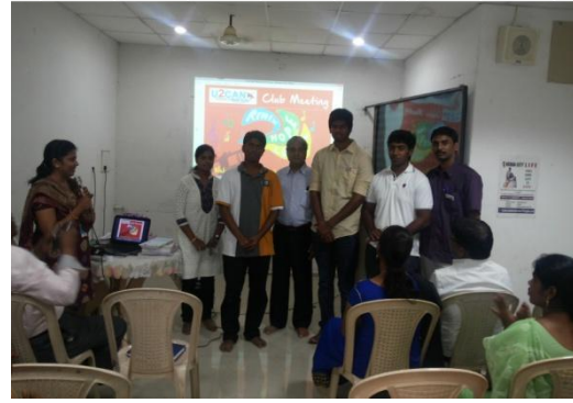
New U2CAN Club Members