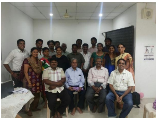
Our U2CAN Team with U2CAN Club Members